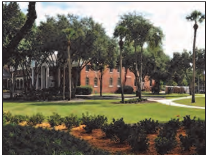
New Campus Landscaping

Greeting new and returning students this year will be numerous renovations and technology upgrades to classroom buildings, residence halls, parking areas and the campus landscape. A new model for the Stetson Honors Program will begin, emphasizing experiential learning and mentoring. A wing of the DuPont-Ball Library is now dedicated to the arts. As part of Stetson’s focus on student success, first-year students will start their First Year Seminar course during orientation and finish that class before Thanksgiving, allowing them to focus on their three other courses for finals.