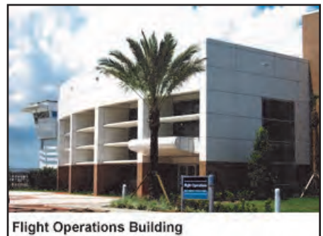
Flight Operations Building