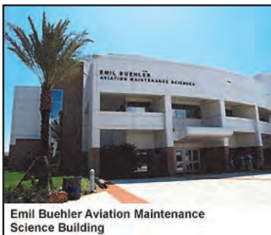
Emil Buehler Aviation Maintenance Science Building