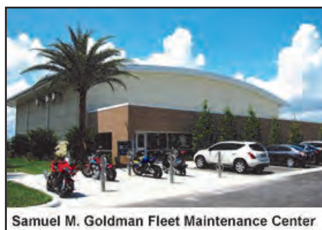
Samuel M. Goldman Fleet Maintenance Center