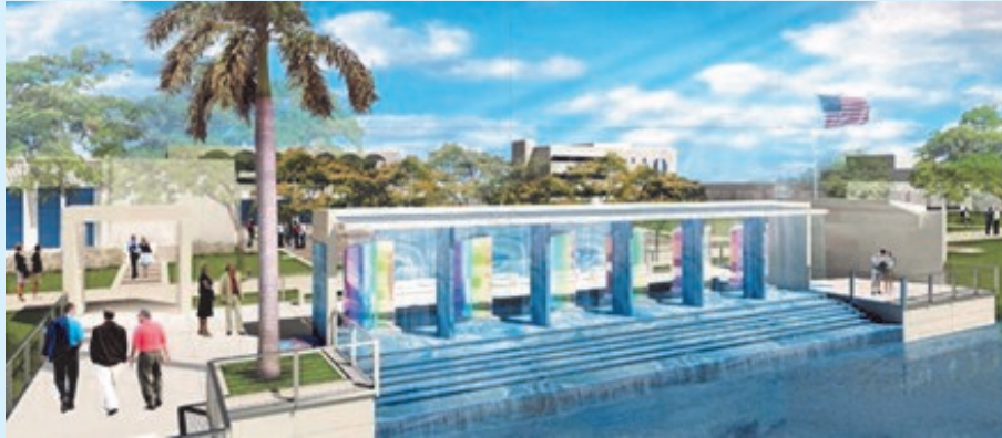
Artist's Rendition of “A Place of Remembrance”

Lynn University students participated in a day of caring in honor of the two faculty members and four students killed in the Haiti Earthquake on January 12, 2010. Community members participated in more than a dozen projects, on and off campus, among them, making sandwiches for after-school programs, painting homes of those less fortunate, building homes for the poor and hosting a spring training game for disabled children. Then the university community came together for the public announcement and unveiling of the plans for a permanent tribute to those lost: the Lynn University Remembrance Plaza.