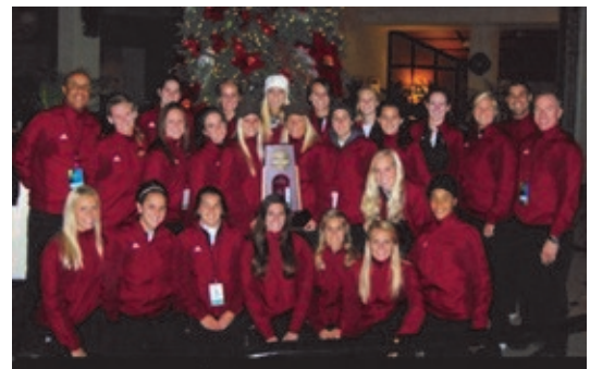
FL Tech's Women's Soccer Team